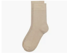
Tan Dress Socks