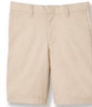
Boys' Twill Walking Shorts