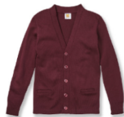
V-Neck Cardigan Sweater with embroidered logo