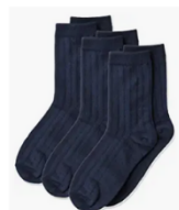
Navy Dress Socks