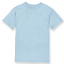
Short Sleeve T-Shirt with heat transferred logo