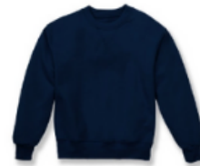
Heavyweight Crewneck Sweatshirt with heat transferred logo