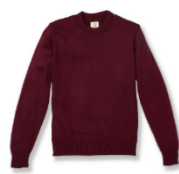
Crewneck Pullover Sweater with embroidered logo