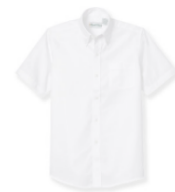
Short Sleeve Oxford Shirt