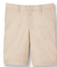
Boys' Twill Walking Shorts