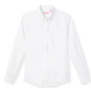
Long Sleeve Oxford Blouse