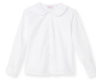
Long Sleeve Peterpan Collar Blouse