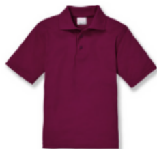
Short Sleeve Polo Shirt with embroidered logo