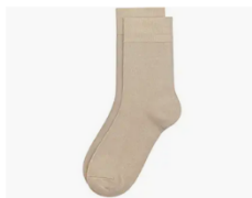
Tan Dress Socks