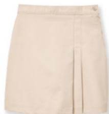
2 Pleat Skort