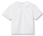
Short Sleeve Peterpan Collar Blouse