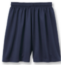
Micromesh Gym Shorts with heat transferred logo